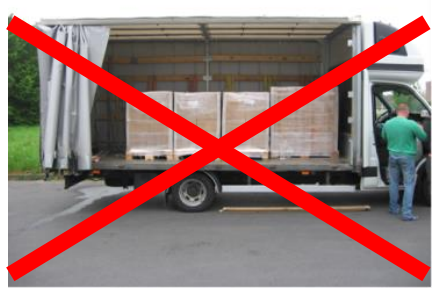
\leftrightarrow space needed for dock leveler =30 cm