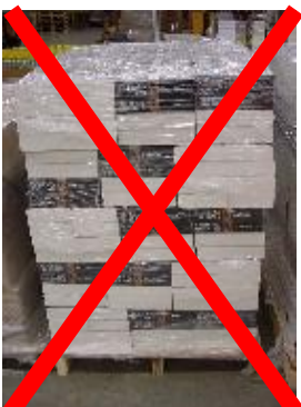
Wrong: goods placed over the edges, badly stacked