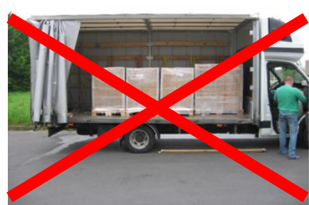
Dockleveller can't be used