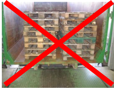
No space for dock leveler