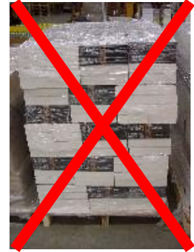
Wrong: goods placed over the edges, badly stacked