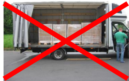
Dockleveller can't be used