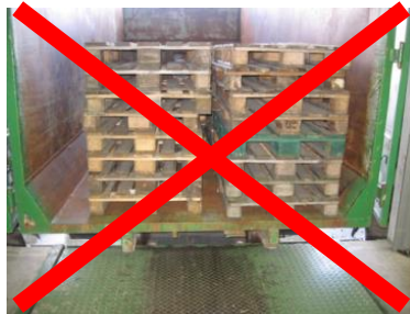
No space for dock leveler